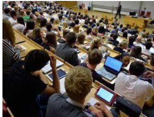
Interactive classroom sessions