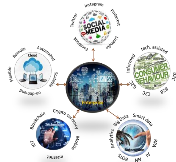
The business ecosystem

Strategic Inflection Solutions has designed a set of interactive workshops on current skill areas as enhancement to the fundamentals the students learn in class; with an aim to get them to be industry ready and thereby increase their employability