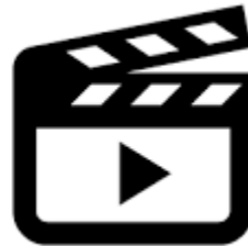
Relevant videos where available