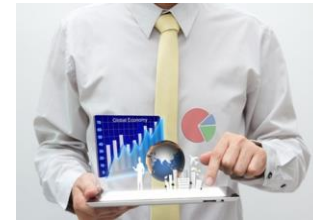
Business simulation exercises where demanded

Earn a certificate of participation at the end of the program