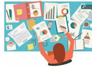
In-class exercises, case studies and short projects